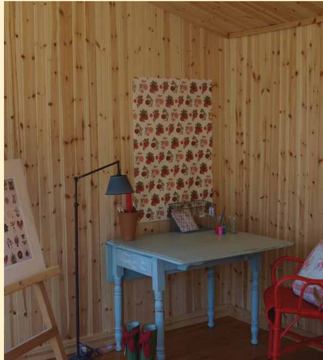
The Garden Studio Collection | Crane Sheds and Summerhouses

1.8 x 2.4m (6 x 8ft) to 6.0 x 6.0m (20 x 20ft)