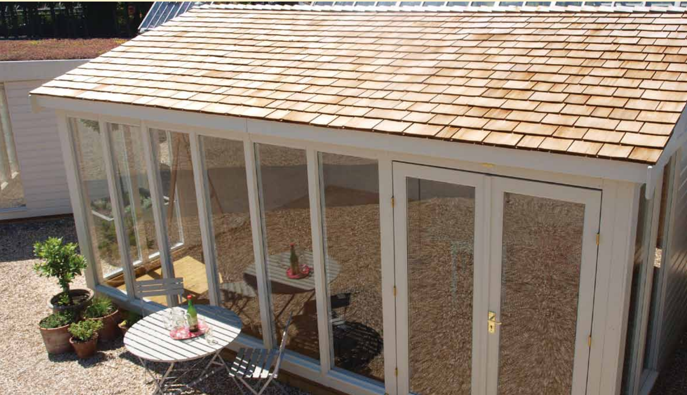
The Garden Studio Collection | Crane Sheds and Summerhouses